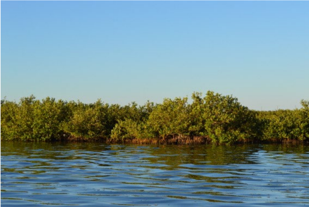
Mangroves on the Texas Coast stabilize shorelines and help absorb storm surge; an example of a non-structural flood mitigation solution.

The implementation of actions, including both structural and non-structural solutions , to reduce flood risk to protect against the loss of life and property.