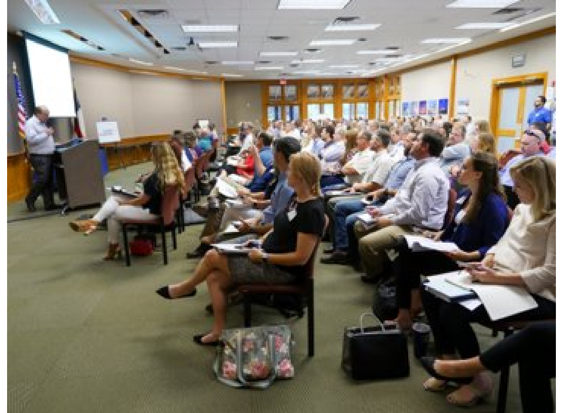
TWDB flood outreach meeting in Bastrop, TX.