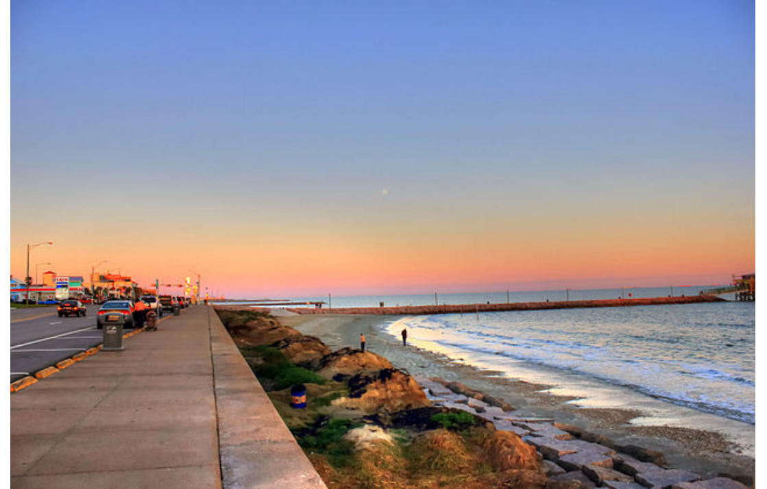
Galveston Seawall, a structural flood mitigation solution.